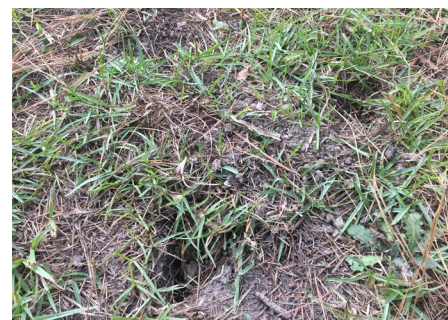
Evidence of Armadillo digging/rooting damage