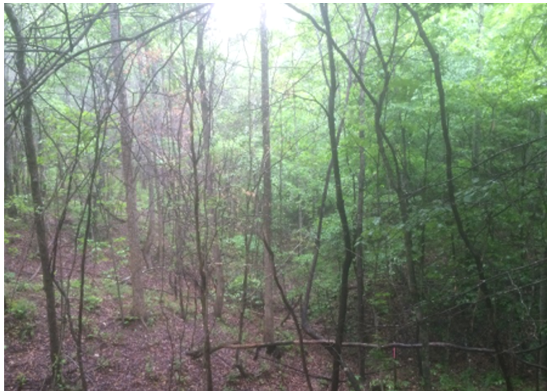
Area on the left received midstory chemical control versus untreated on the right

Herbicide treatment using the hack and squirt method enables the landowner to both begin to enhance understory light conditions and gain control over regeneration of less desirable species. Common herbicides used for stem injection include imazapyr (Arsenal AC, Polaris AC, Imazapyr 4 SL), triclopyr (Garlon 3A, Tricera), and picloram (Tordon RTU). Each of these herbicides have some species that are resistant yielding the chemical ineffective at inducing mortality. Imazapyr does not control leguminous species such as locust, mimosa, etc and conifer species such as pines and cedar. Triclopyr inadequately deadens sourwood where as picloram may not control sassafras.